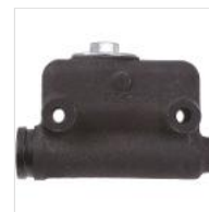
1957-1958 Studebaker Golden Hawk... $50.23 PartsGeek.com