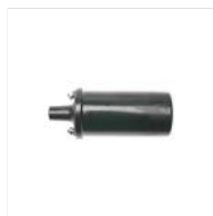
1956-1957 Studebaker Golden Hawk... $21.38 PartsGeek.com