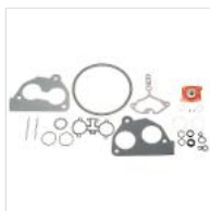
1956-1958 Studebaker Golden Hawk... $44.63 PartsGeek.com