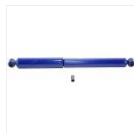
1956 Studebaker Golden Hawk Rear... $16.32 PartsGeek.com