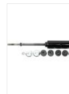
1956 Studebaker G Hawk Shock... $44.78 Auto Parts Wareho